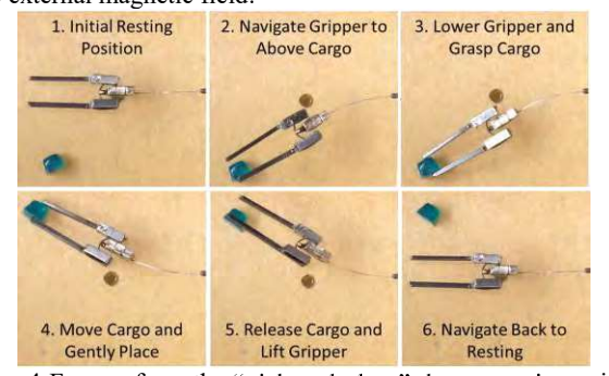
Fig. 4 Frames from the "pick and place" demonstration using the 4mm magnetically actuated gripper-wrist.